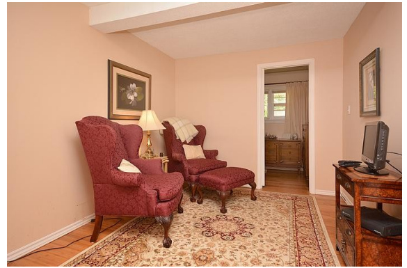
Master Bedroom has room for cozy sitting area with a walk-in closet across the back of the room. The room works just as well if you prefer to switch the bed & seating area.