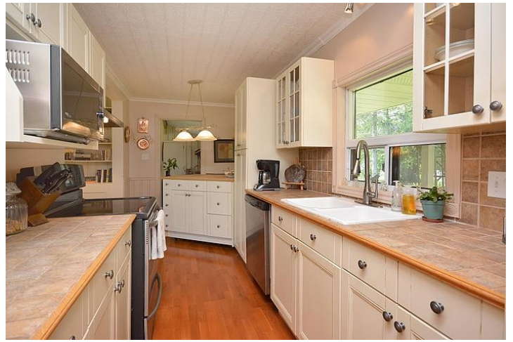
The recently remodelled kitchen has ceramic countertops, wood floors & a moveable island