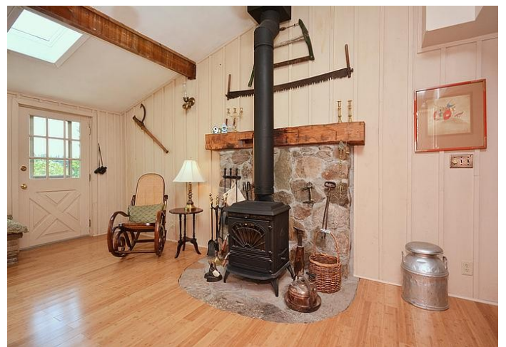
Dining room has vaulted ceiling, bamboo flooring, a wood stove and walk-out to the raised deck. It's a fabulous spot to hang out—whether you are by yourself or serving Christmas Dinner!