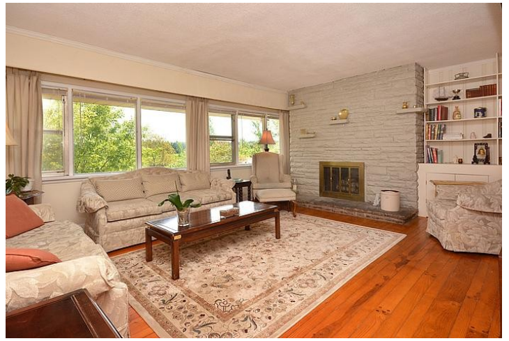
The spacious Living Room features a beautiful stone fireplace, built-in bookshelves and pegged floors. The best part, however, is standing at the window looking south over the pond and rolling Caledon countryside.