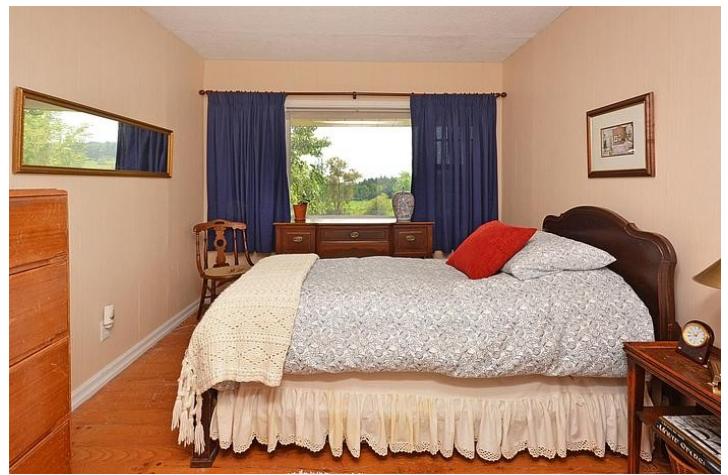
The 2nd & 3rd bedrooms both have hardwood floors and southern views of the pond and countryside. The room that is currently used as an office also has a private doorway to the main bathroom.