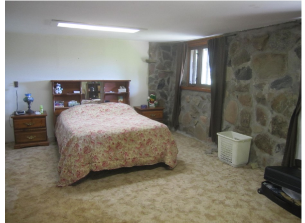
The lower level apartment has a fully functioning kitchen, including a dishwasher. This open concept space allows for an easy and casual lifestyle. The stone wall façade carries across 2 rooms, plus the living room has a bay window and wood stove. There is a walk-out from both the kitchen & living rooms onto a private, covered patio.