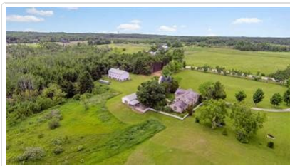
Aerial House & Fields