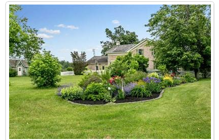
Gardens & Playhouse/Shed