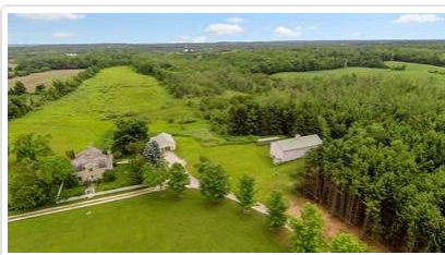
Front & Back Yard & Barn