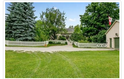
Garage & Side Entrance