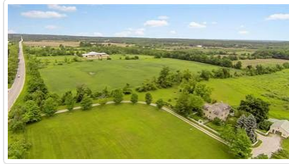
Front Yard & Field