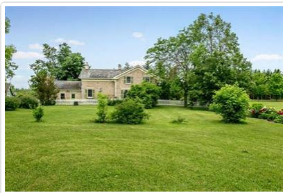
Side of House & Yard