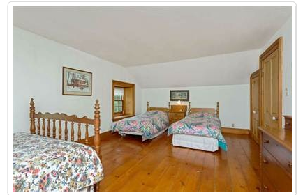
4th Loft Bed