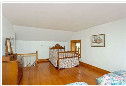
4th Loft Bed2