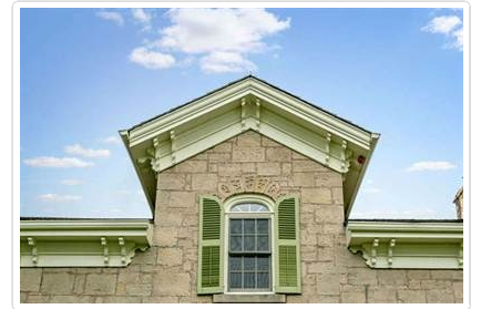
1865 Engraved in stone